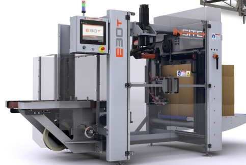
INSITE® E30T Case Erector