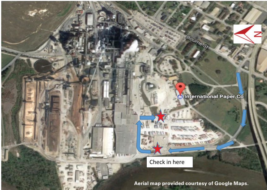
Aerial map provided courtesy of Google Maps.